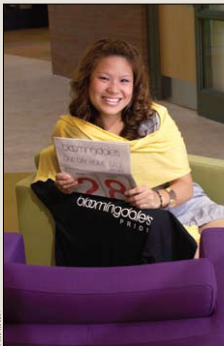
A. SUE WESSLER