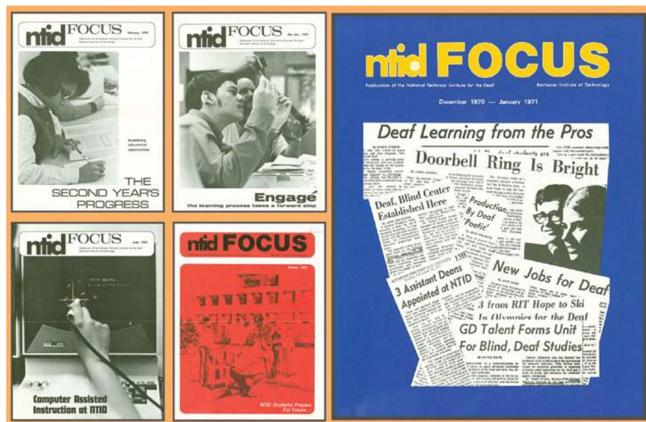
From the Archive Front covers of "FOCUS" issues from 1970.

More information can be found at: rit.edu/ntid/museum .