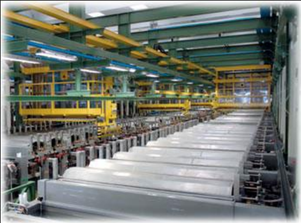
Example of an automatic hoist plating line