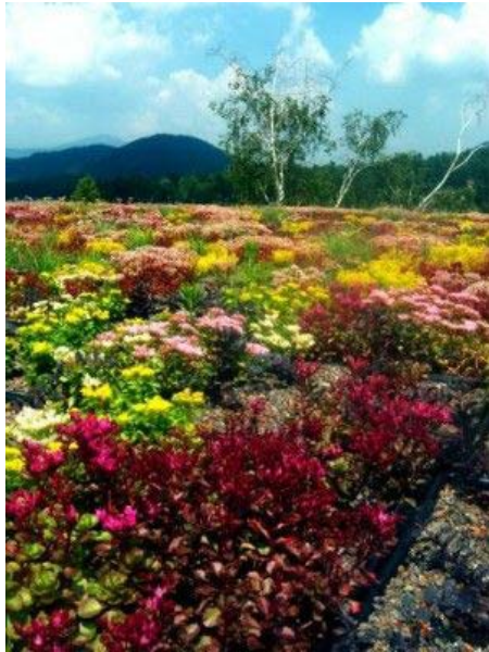
Golden Arrow's green roof top

HOW ARE YOU CALCULATING ROI? WHAT'S INCLUDED IN YOUR FORMULA?