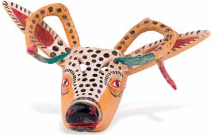
Early 20th century Native American mask