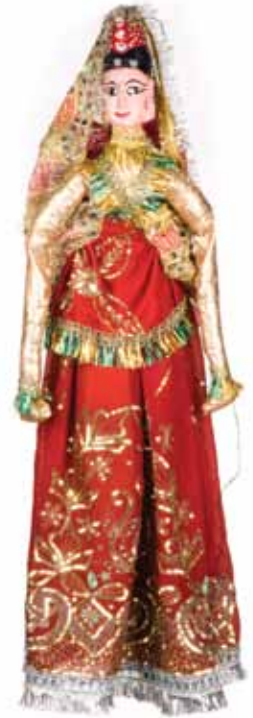
Early 20th century Indian puppet

RIT has the fourth oldest, and one of the largest, experiential education programs in the world. You'll gain valuable experience through cooperative education, internships, and research opportunities. Both tracks of the museum studies program require internships or co-op assignments at relevant cultural institutions. You can choose to complete this requirement at cultural institutions locally, nationally, or internationally.