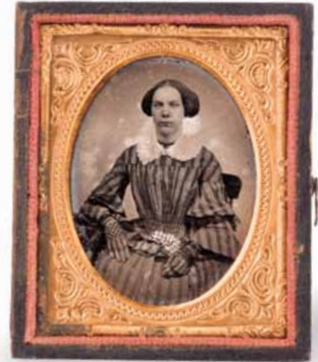
Mid-19th century American ambrotype

The bachelor of science degree in museum studies provides a solid background for those who choose to pursue graduate study. The museum and information studies track will prepare you for such diverse graduate programs as a master of arts degree in museum studies, art history, informatics, or arts management; a master of library science degree; or a master of business administration degree. Students pursuing the art conservation track will be well prepared to enter a master's level program in art conservation.