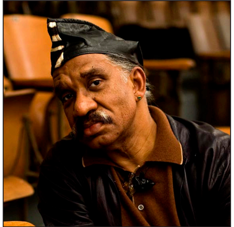
Tony Award Winning Choreographer, Garth Fagan