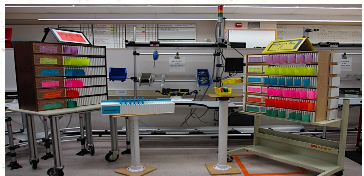
Heijunka boxes built by students