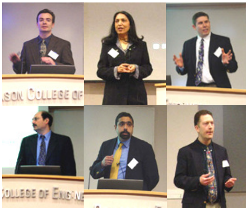
Fig.3. Educators from K-12 to university participated in NSF Sponsored Nanotechnology and MEMS Education Workshop.

This workshop was unique in a sense that it brought together educators from K-12, college, university, and industrial participants to share their perspectives and knowledge on the field of Nanotechnology and MEMS. This workshop should encourage future synergistic collaboration between government, industrial, and education institutions in the area to fuel research initiative and rapid dissemination of knowledge at every level of education. This workshop was conducted successfully and had met its objective.