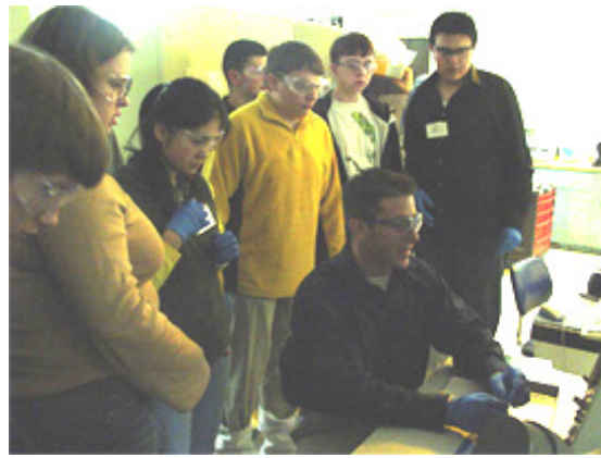
Fig. 4. Middle and High School Students learned about scanning electron microscope (SEM).

For more information on the nanotechnology initiatives at RIT, please visit: