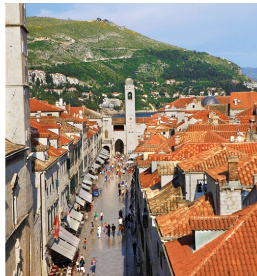
RIT has international campuses in China, Croatia, Dubai, and Kosovo. Pictured above is Dubrovnik, Croatia.