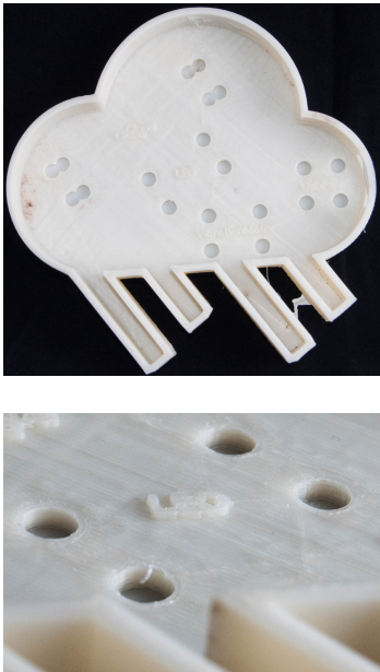
Figure 3: Sample output from Printy, illustrating the mounting holes for modules, and a close-up of the embossed module name.

The capabilities currently exist for Jenny to download a model of an object to print via online services such as Thingiverse 4 ; to assemble pre-specified modular electronic circuits such as littleBits 5 ; and to configure the electronics to react to online events via a service like If This Then That 6 (IFTTT). However, to combine the circuit with the downloaded object in itself requires a non-trivial level of technical skill; to further decompose the circuit, put parts of it in desired locations, fit the rest of the modules in where they will best fit, and to link those components together via wires, demands a high level of patience, experience, and technical know-how.