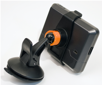
Figure 2: Examples of augmented fabrication in practice. From top: a fix for a broken suitcase wheel; a cover for a camera flash mount point; and a fix for a broken GPS mount.

Non-experts do, however, have definite ideas about what they would build if they could use a 3D printer. Using experience prototyping, Shewbridge et al. explored the desires typical consumers might have for 3D-printed objects [19]. One of the largest categories the participants identified was improving and repairing existing objects . Buehler et al.'s study of publicly-shared assistive technology for 3D printing [3] reflects this trend: many of the objects they found were designed to interact with existing objects such as body parts (e.g. prosthetics), pill bottles, or knives.