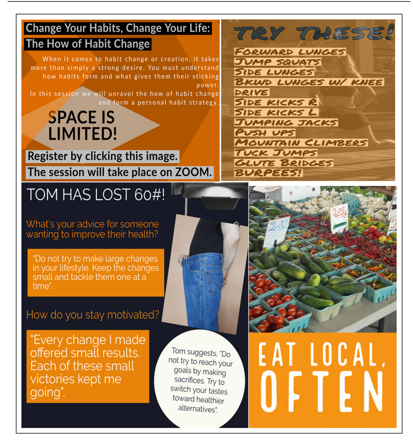
Figure 2. Employee wellness program newsletter example.