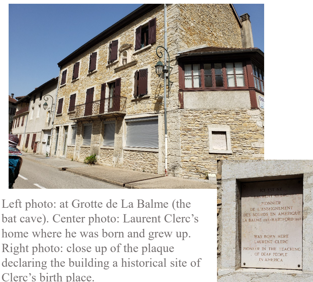
Left photo: at Grotte de La Balme (the bat cave). Center photo: Laurent Clerc's home where he was born and grew up. Right photo: close up of the plaque declaring the building a historical site of Clerc's birth place.