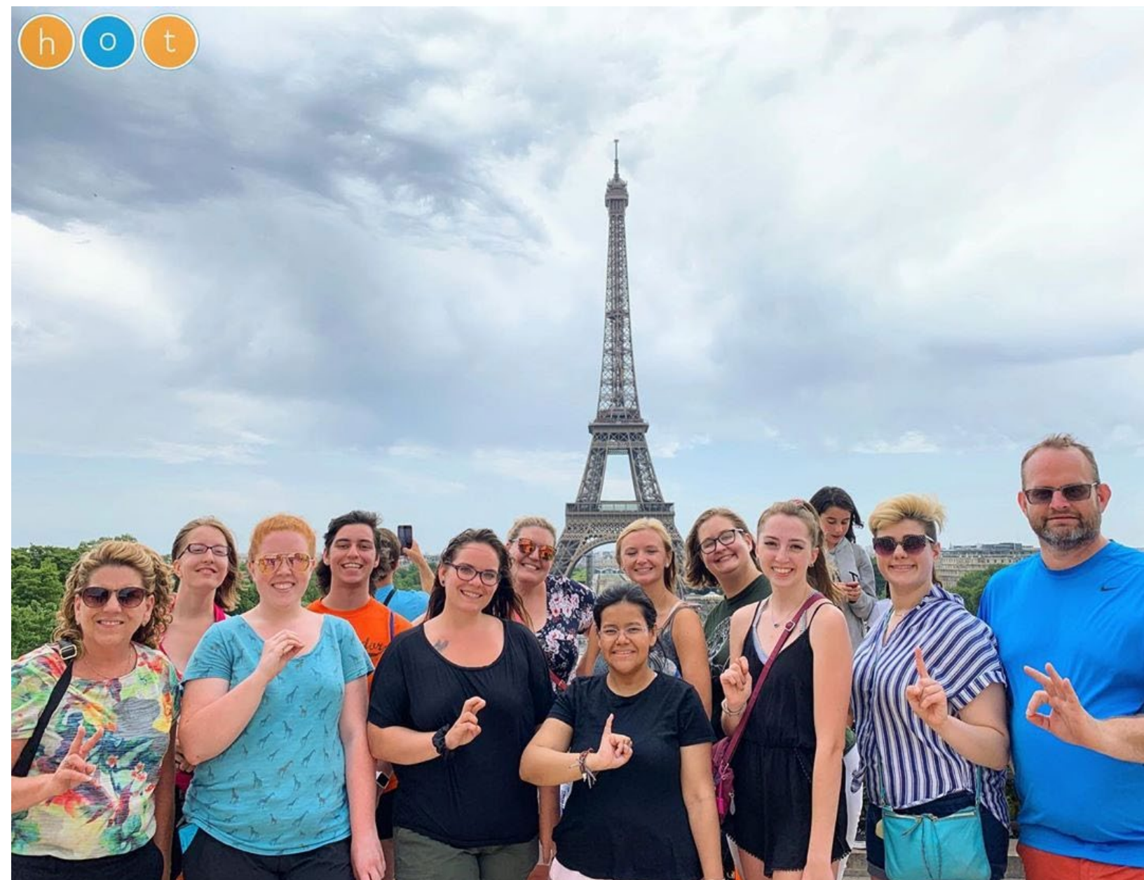
RIT/NTID Study Abroad 2019 at the Eiffel Tower Paris, France