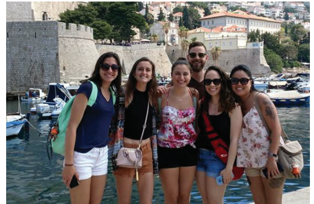
Nutrition & The Mediterranean Diet | RIT Faculty-Led Program

No language requirements. Courses taught in English.