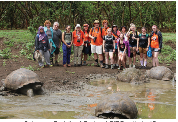
Galapagos Evolution & Ecology | RIT Faculty-Led Program