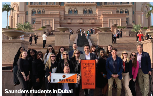
Saunders students in Dubai