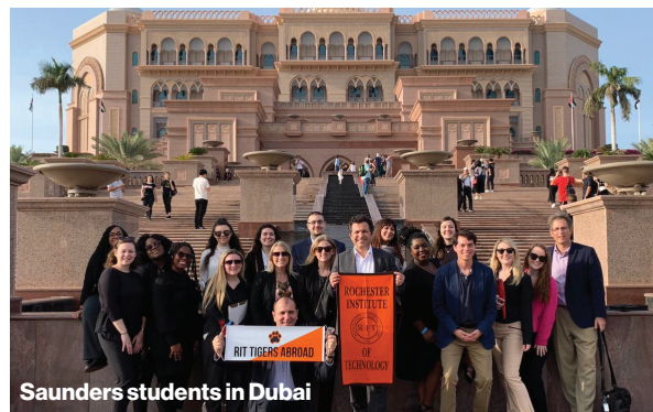
Saunders students in Dubai