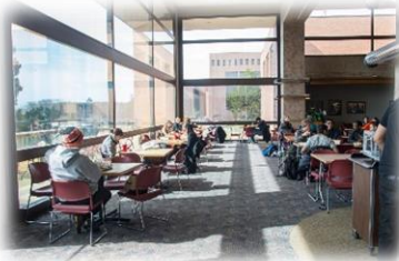
Brick City Café