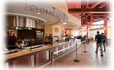
Global Village Cantina & Grill