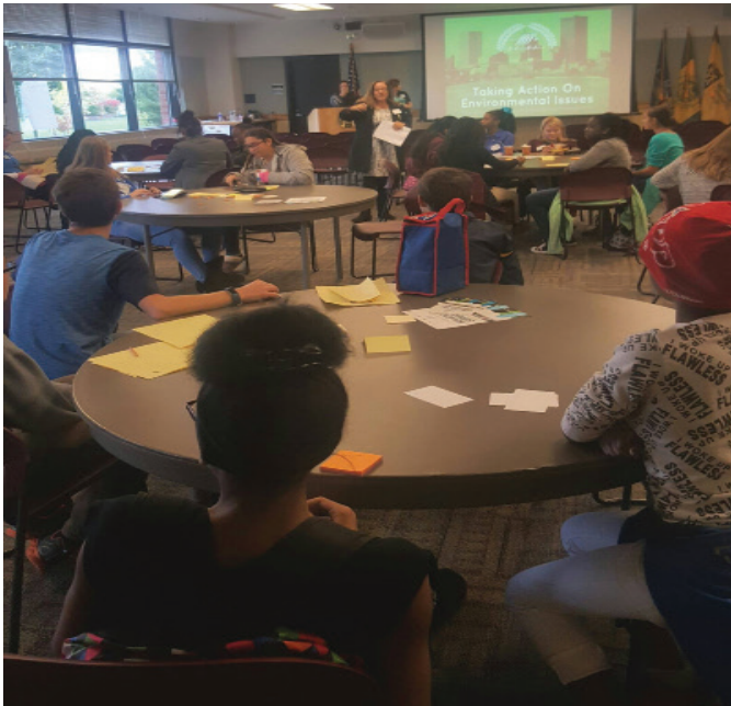
October 28, 2016.

This was also the first year that a youth category was added to the competition, which encouraged students who participated in the Green Story Guide to create and submit their own films on the environment in the future. Students viewing films and being led through environmental education opportunities at Monroe Community College Leadership Conference.