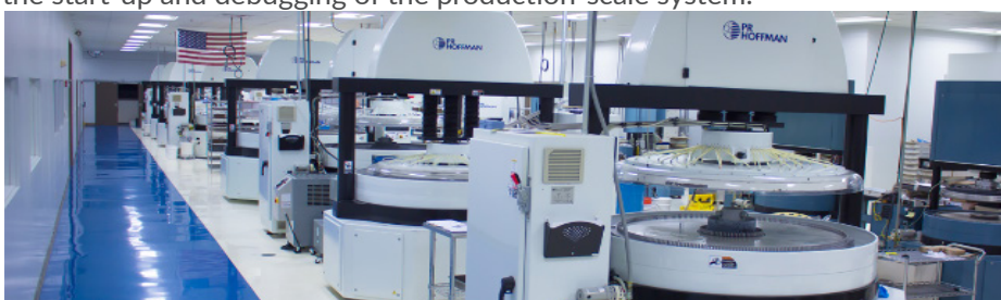
Sydor's Lens Polishing Equipment