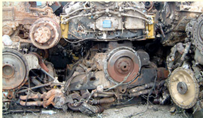
Example of Tecmotiv's dirty challenges that are comprised of military vehicle parts.

Vehicle parts and assemblies that Tecmotiv remanufactures often arrive exceptionally dirty, and the company was experiencing difficulties cleaning parts consistently and cost-effectively. Surface cleaning operations presented a substantial production bottleneck that was severely limiting revenue growth.