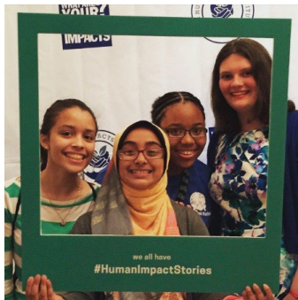
Attendees from Climate sHeros event on June 17, 2015.

Four community trainings were held with a total of 56 participants. PowerPoint presentations, a brochure, and educational tip sheets for each topic were developed and disseminated to all attendees. Participants received non-toxic cleaning kits. On June 17th, 2015 a Climate sHeros event was held at the French Consulate to showcase a combined StoryCorps exhibit that shared stories about pollution prevention and climate change concerns directly from 20 women in the community. The successful event had 300 people in attendance. The Health and Consumer training materials were also shared at an inaugural Youth Leadership Intensive, a six week environmental program for local high school students, at the Green School.