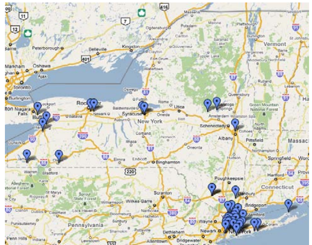
Location of dry cleaners who indicate they perform PWC

Results show that the adoption of PWC has remained slow due to the perceived cleaning ability of PWC. Almost one quarter of all respondents believe that if a garment is marked with a "Dry Clean Only" care tag, then it cannot be wet cleaned. Educating dry cleaners about the garment benefits as well as environmental and cost benefits will further increase the adoption rate by dry cleaners.