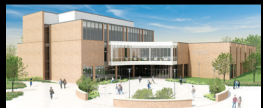
Conceptual rendering – new front elevation and entrance.