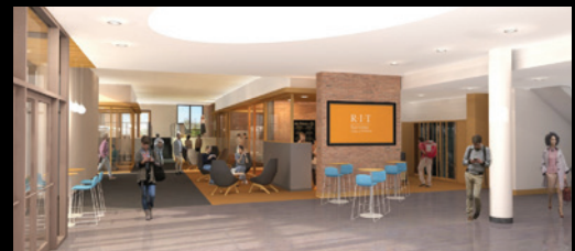
Proposed student collaboration space.