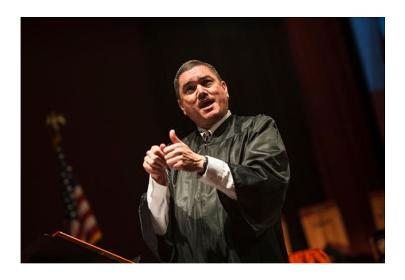
Are the Commencement Ceremonies ASL Interpreted and Real-Time Captioned? Yes, all ceremonies are ASL interpreted. All ceremonies are also real-time captioned.