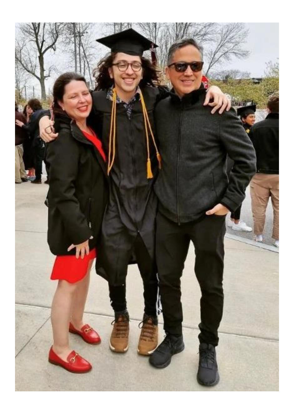
Share your Posts on Social Media and Tag them with #RITGrad.

This is a special time to remember. Take lots of pictures to remember your time at RIT fondly.