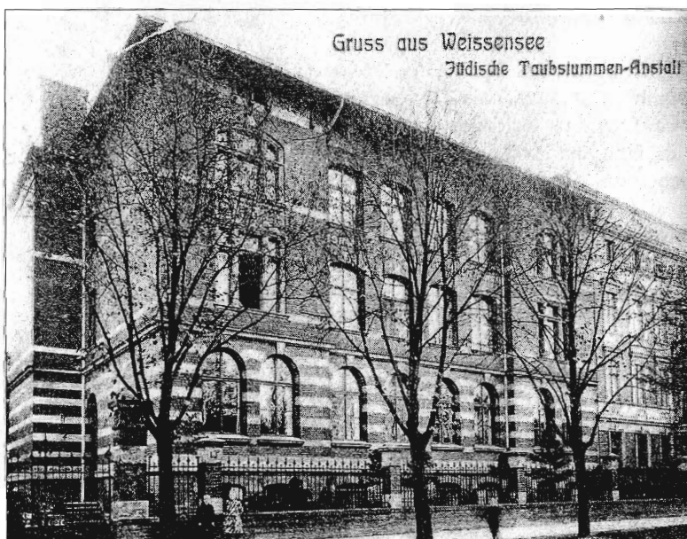
Jewish School for Deaf and Dumb in Berlin