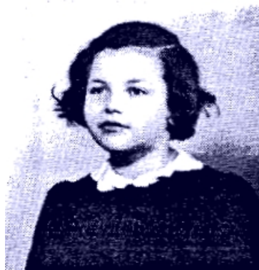
My older sister