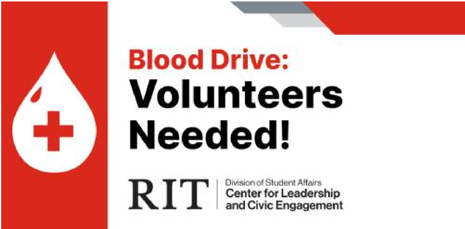
Table For the CLCE Blood Drive!

The CLCE needs volunteers for their upcoming Red Cross blood drive! This role is perfect for volunteers who enjoy connecting with others and want to help make a meaningful impact on campus. All materials and talking points will be provided so, just bring your enthusiasm!