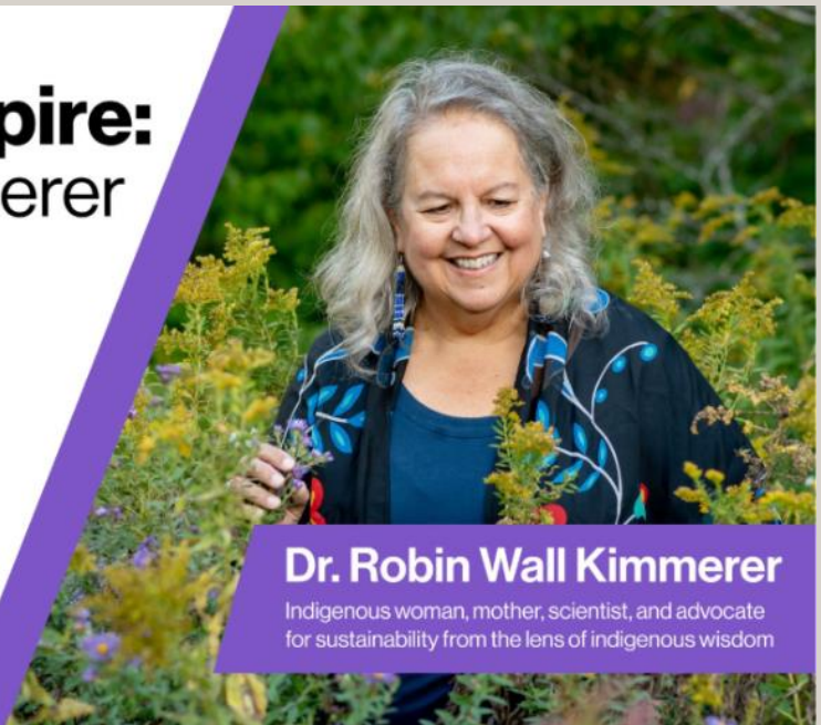
Dr. Robin Wall Kimmerer

Indigenous woman, mother, scientist, and advocate for sustainability from the lens of indigenous wisdom