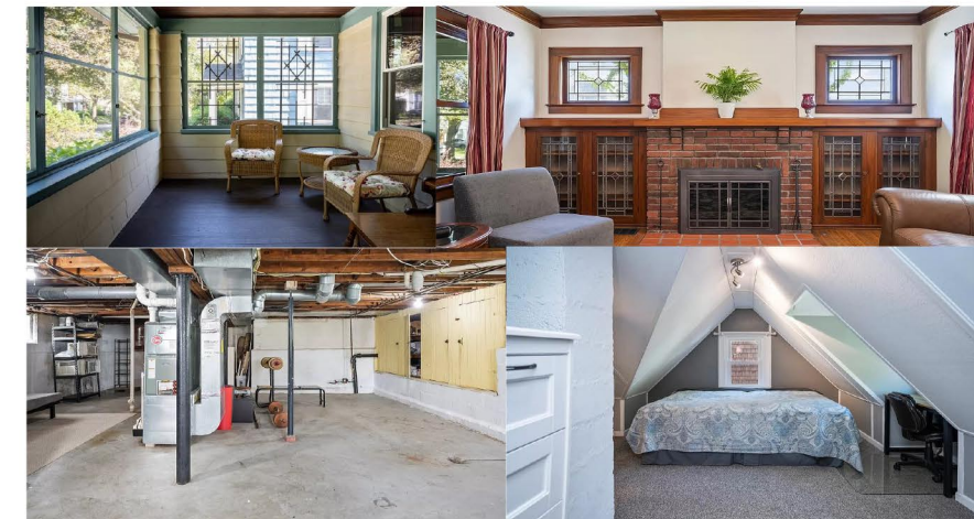
TOO HOT !