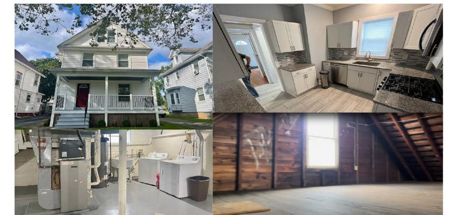
JUST RIGHT ✓