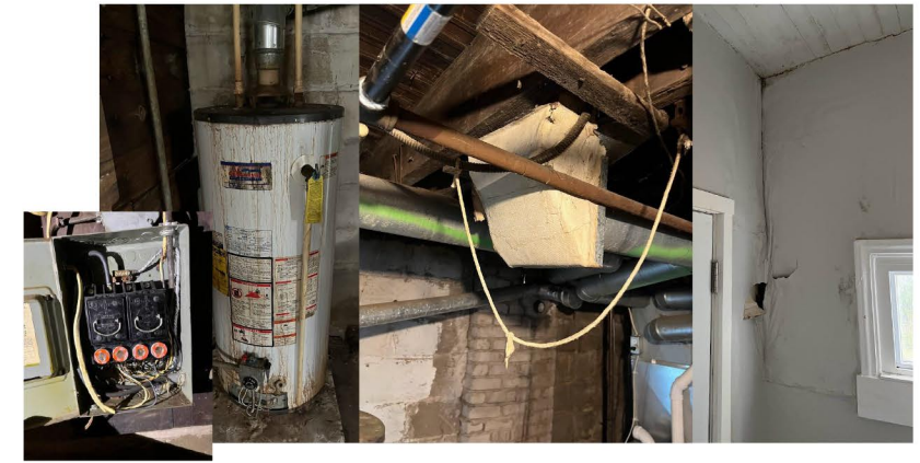
TOO COLD !