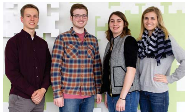
BMES Class Representatives

BMES provides the tools and resources students need to excel in biomedical engineering. The benefits of membership for those studying to become biomedical engineers are invaluable. The Society has over 145 student chapters and more than 4,500 student members. The RIT student chapter focuses on career development, networking, and leadership skills.