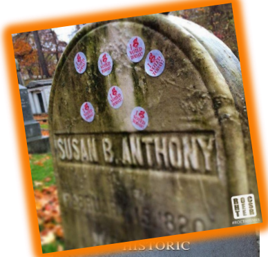
HISTORIC MT. HOPE CEMETERY NORTH ENTRANCE