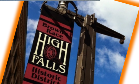
15 UPPER FALLS, GENESEE RIVER, ROCHESTER, N. Y.