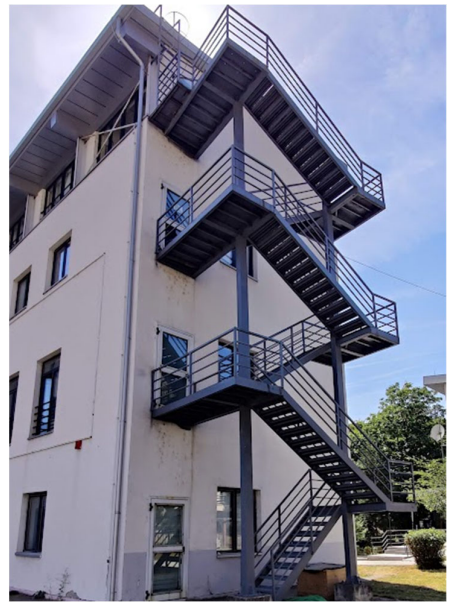
New Staircase (model sample based on existing stairs in different place)

RIT Kosovo (A.U.K.) is pleased to invite you to submit a proposal for the Removal of Emergency stairs object and Construction of new Emergency stairs made of metal. The purpose of this project is to remove the existing object which is not properly connected to the main building and replace it (most likely a different place) with a metal construction one. Participants in the tender are welcome to visit the site upon appointment to get a clear overview of the tender requirements. Please find below pictures of the existing metal constructed staircase in a different part of the building new stairs should be based on and object needing removal.