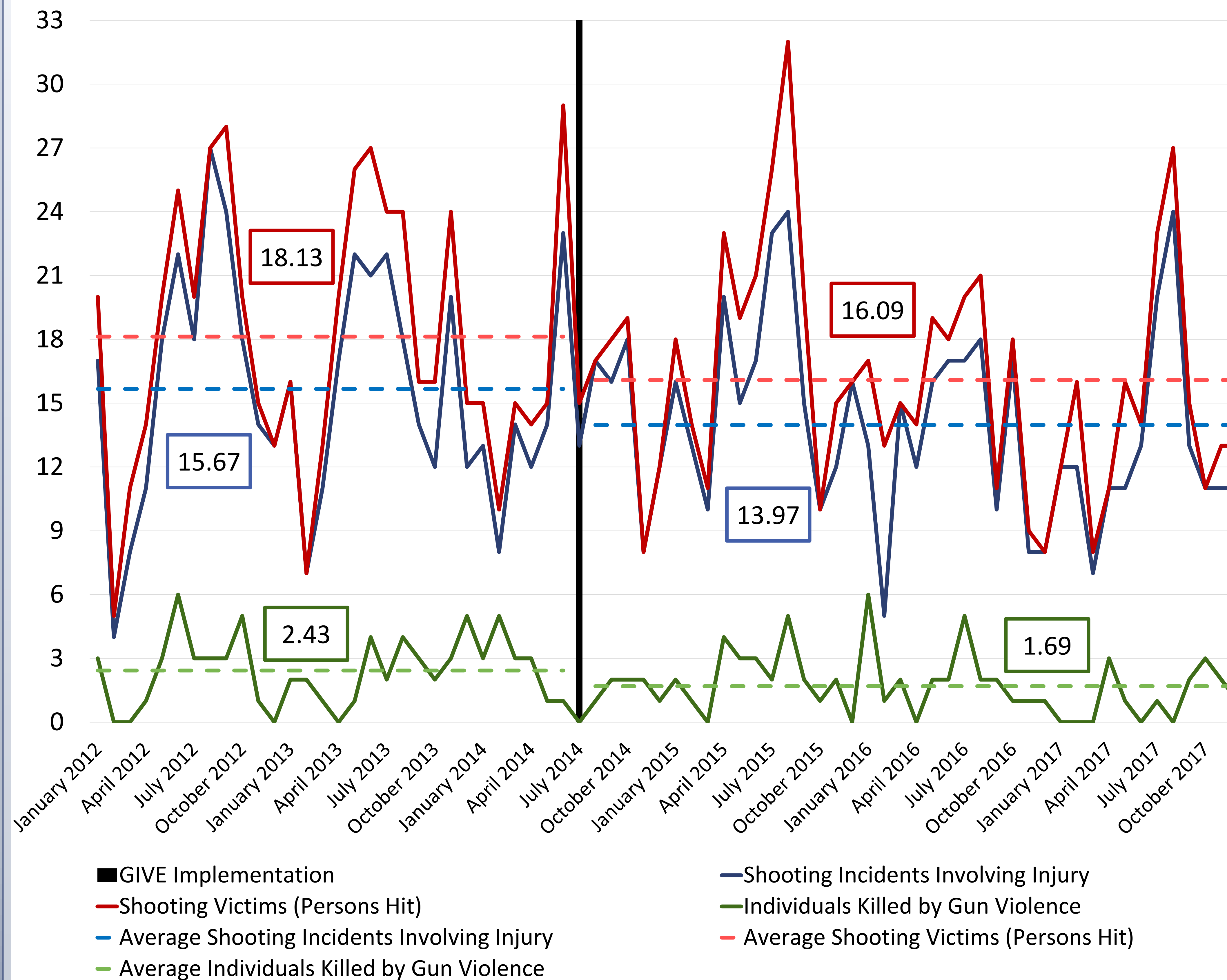
Monthly Firearm-Related Crime Count Rochester, NY: January 2012 - December 2017

Shooting victims decreased 11%, about 2 fewer victims per month