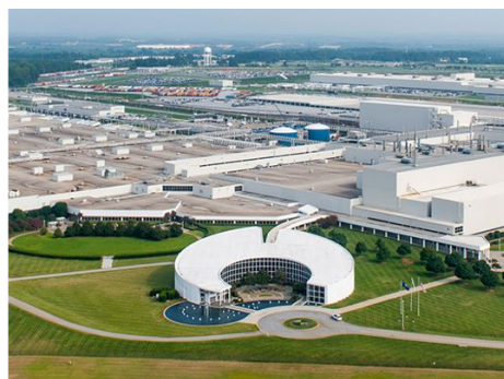
BMW Manufacturing Tour