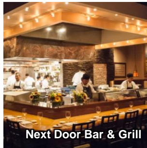
Next Door Bar & Grill