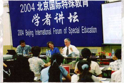
Experts of USA Mental Retardation Association gives a dissertation