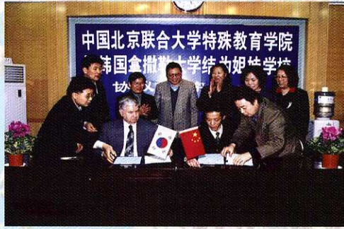
The college established friendly relationship with Korea Nazarene University