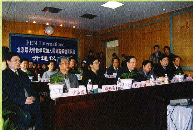
The college's joining PEN-International successfully signifies the college's first integrating into the world in special education

The College owns teaching building, experimental building, dormitory building, comprehensive special teaching building, gymnasiums and ground track fields in our college. In recent years, our college has newly built the psychology laboratory, electrician and electronic laboratory, physiology laboratory, and many special classrooms, such as PEN-International video conference classroom, hearing examining and language training classrooms, graphic design practical training workrooms, office automation practical training operating rooms, piano tuning practical training operating rooms, photographing classrooms and Apple computer classrooms, as well as the well-equipped computer classrooms, phonetic classrooms, laboratories, library, and piano rooms. The college is flowers covered with beautiful environment.