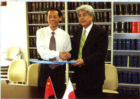
The college established friendly relationship with Tsukuba College of Technology University of Japan