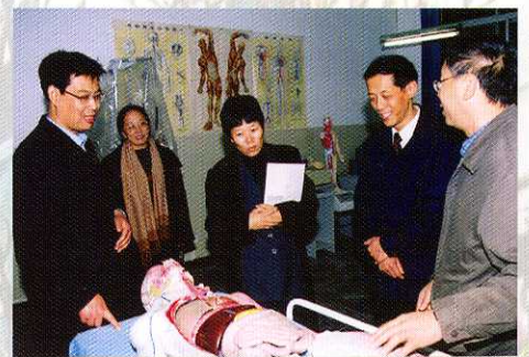
Officers of International Visual Impairment Organization visit organic samples room