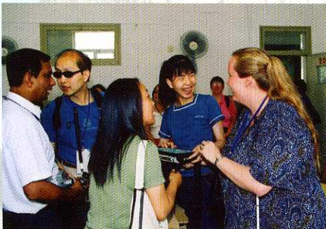
Delegates of International organization for the disabled talk with the blind students warmly