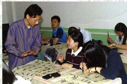
Korean students learn Chinese calligraphy