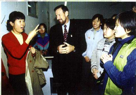
Talk happily with Experts and Friends from Gallaudet University