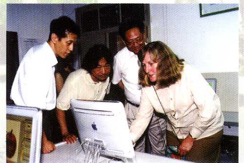
Teacher's delegation of Australia New England University is visiting the Apple Computer Training Room