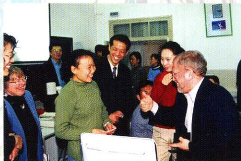
Experts of USA National Technical Institute for the Deaf are talking with the deaf students happily