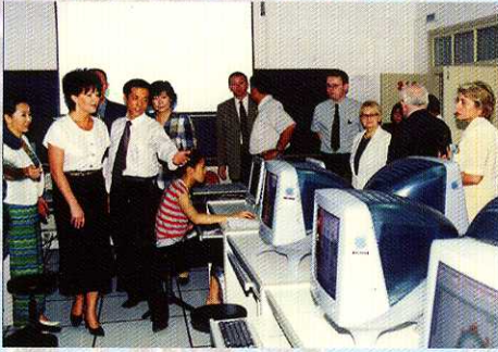
The first lady of Poland visits our college