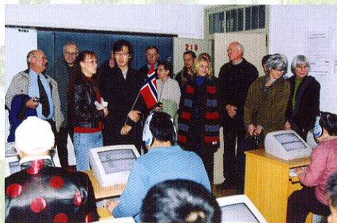
Norway teacher's delegation of special education visit the college