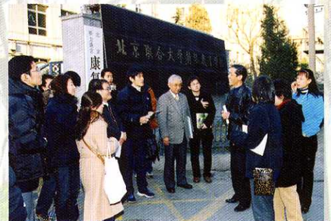
Friends from Japanese Miyagi University of Education visit our college