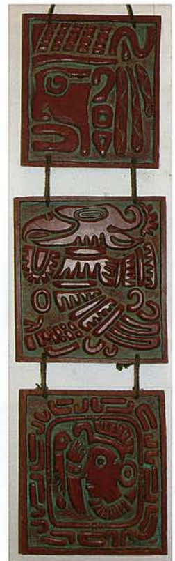
Wooden sculpture relief