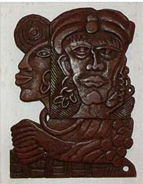
Wooden sculpture relief