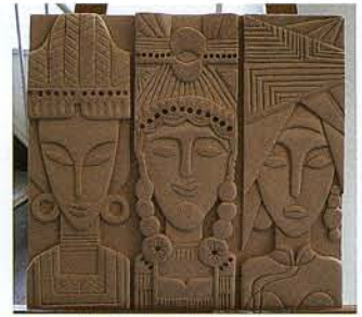
Wooden sculpture relief