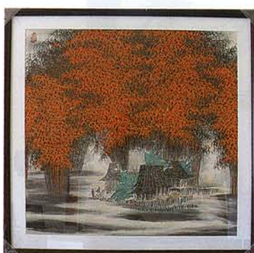
Chinese traditional painting