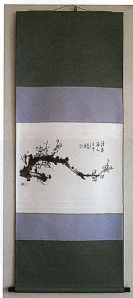
Ink painting hanging scroll