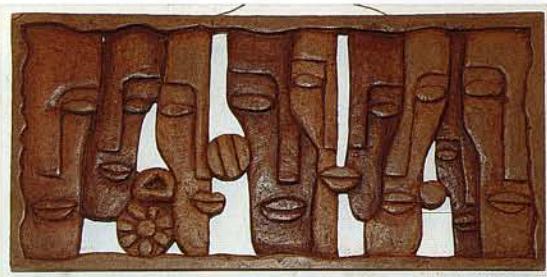
Wooden sculpture relief