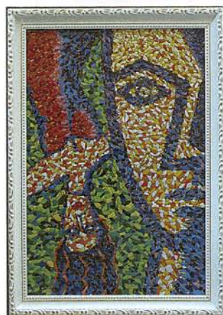
Mosaic (made by eggshell)