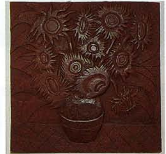
Wooden sculpture relief