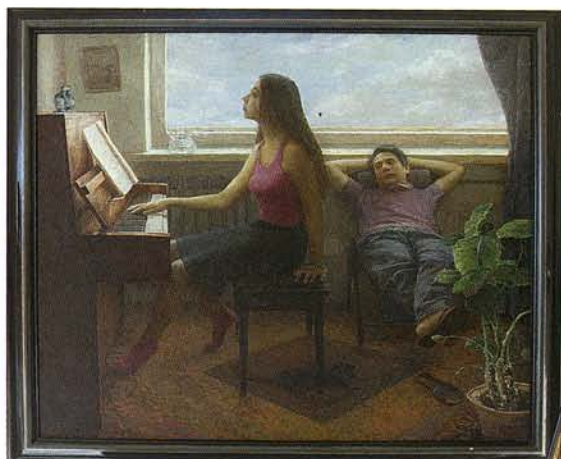
Oil painting (teacher's work)