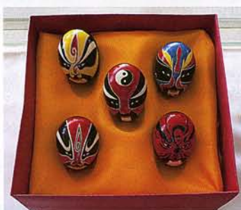
Peking opera mask (made by eggshell)