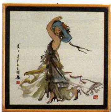
Chinese traditional painting (teacher's work)