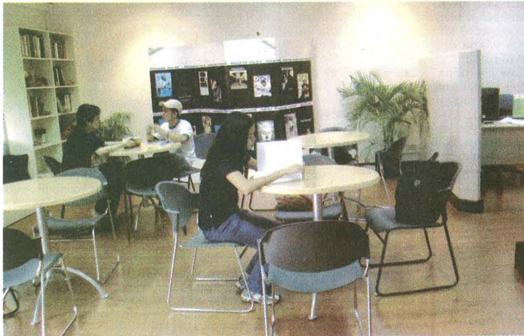
The PEN Learning Center also serves as a resource center for deaf students and their teachers, ensuring that technologies and reading materials are easily accessible for one-on-one or small group consultations and tutoring.