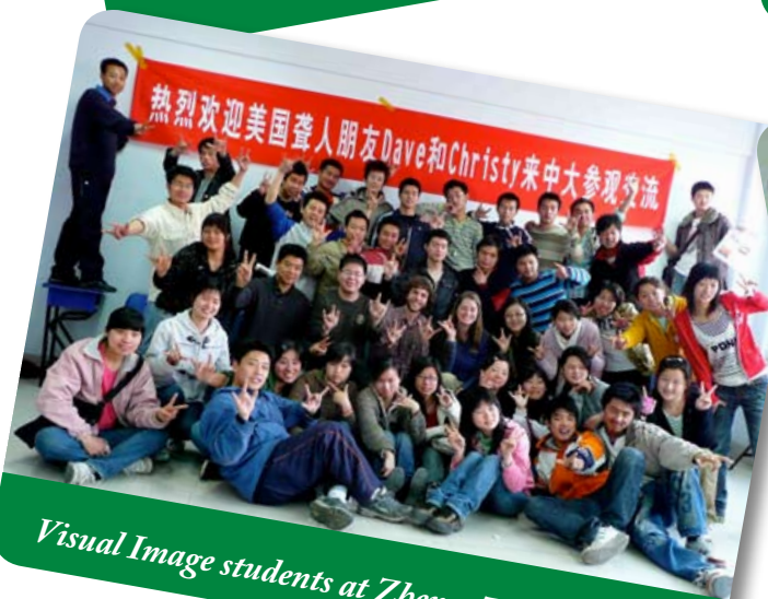
Visual Image students at Zheng-Zhou University