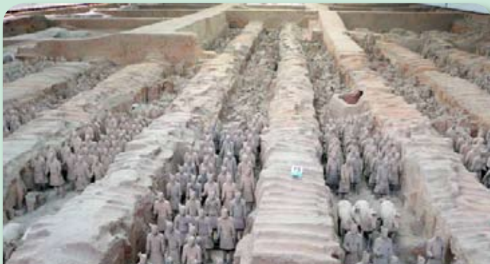
Army of Terracotta: 8,000 warrior statues were discovered by local farmers in 1974.