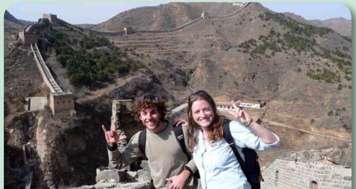
The Great Wall of China is over 2,000 years old and took 100 years to build!