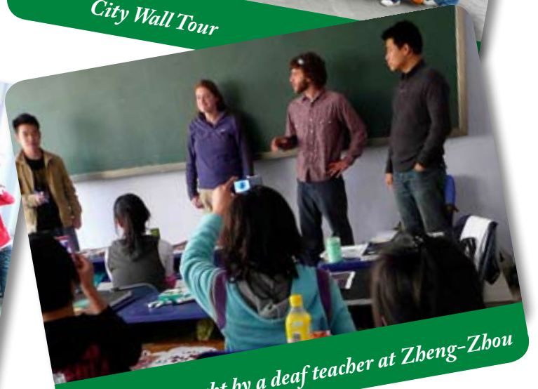
Art class taught by a deaf teacher at Zheng-Zhou