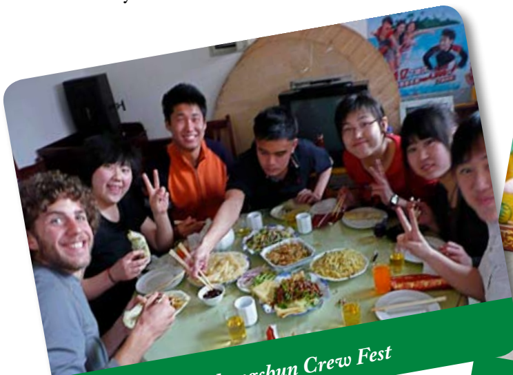
Changchun Crew Fest

So ask yourselves, do we offer this kind of hospitality when foreigners visit our country? How can we make their stay as comfortable as possible? In America especially, how can we help change the bad rep our country has overseas?