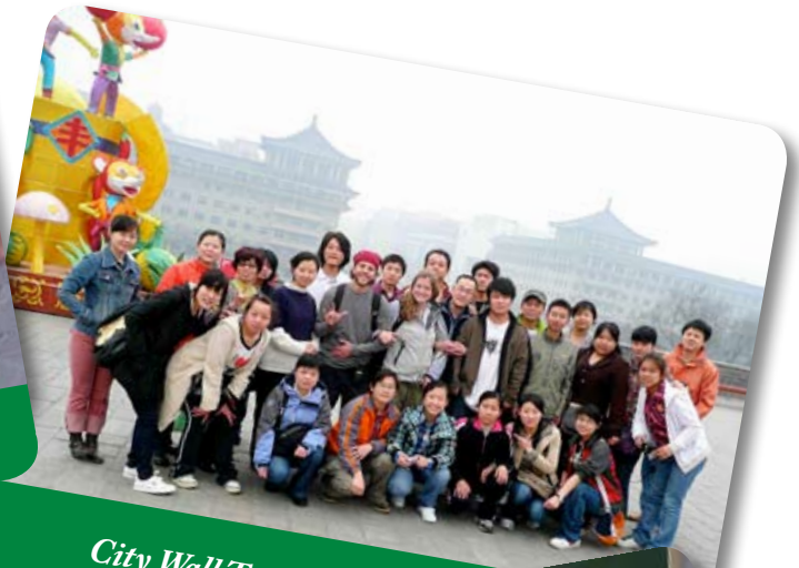
City Wall Tour