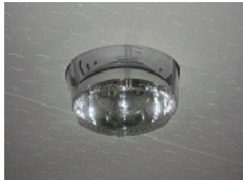
#1 Flash Lights on the ceiling