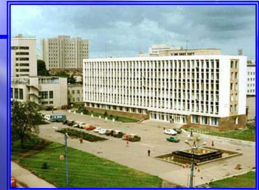
Republic of Mordoviya