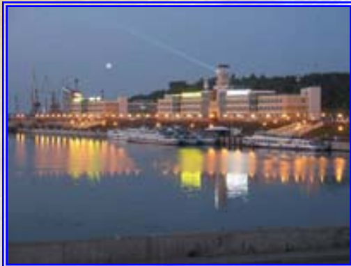
Republic of Tchuvasiya