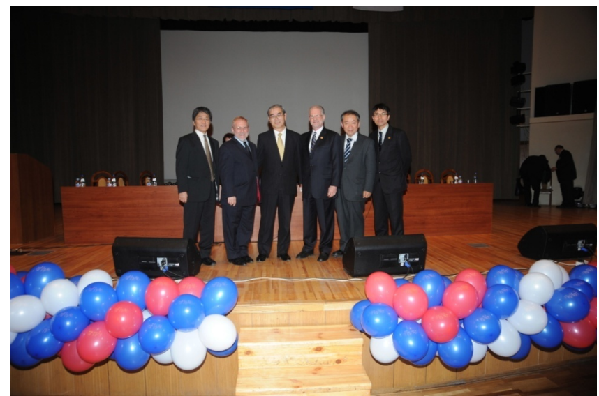
PEN International members got together to celebrate 75<sup>th</sup> Anniversary of Russian Higher Education for people with disability