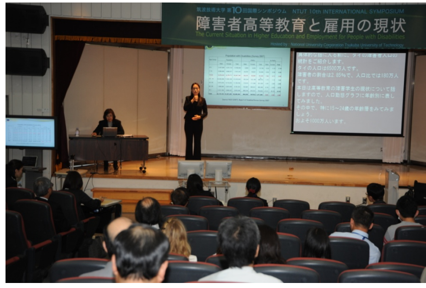
" Employment and Higher Education for the handicdapped"