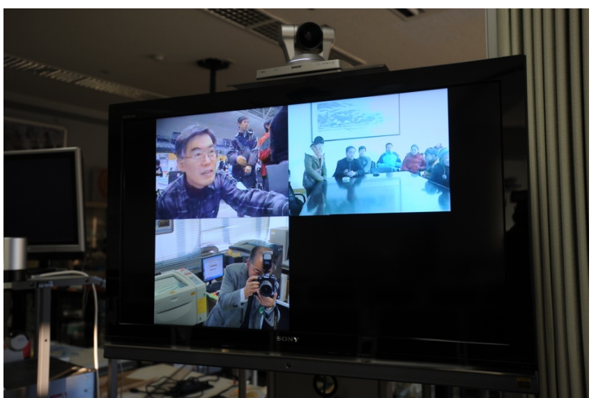
Connection among Fest site (left above), Changchun (right above) and NTUT (left below)