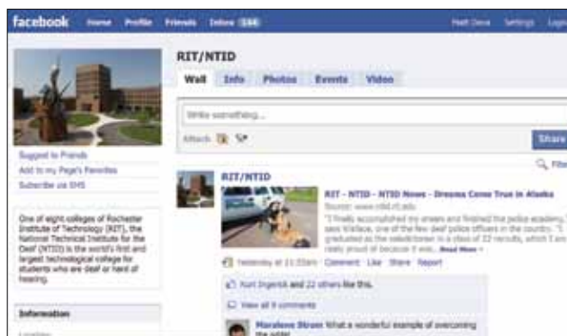
Be a fan! RIT/NTID’s Facebook fan page is part of the college’s overall social media strategy.

RIT/NTID’s YouTube channel ( www.youtube.com/user/RITNTID ) and Twitter newsfeed ( twitter.com/NTID_News ) also provide audiences with access to archived videos and the latest news and information.