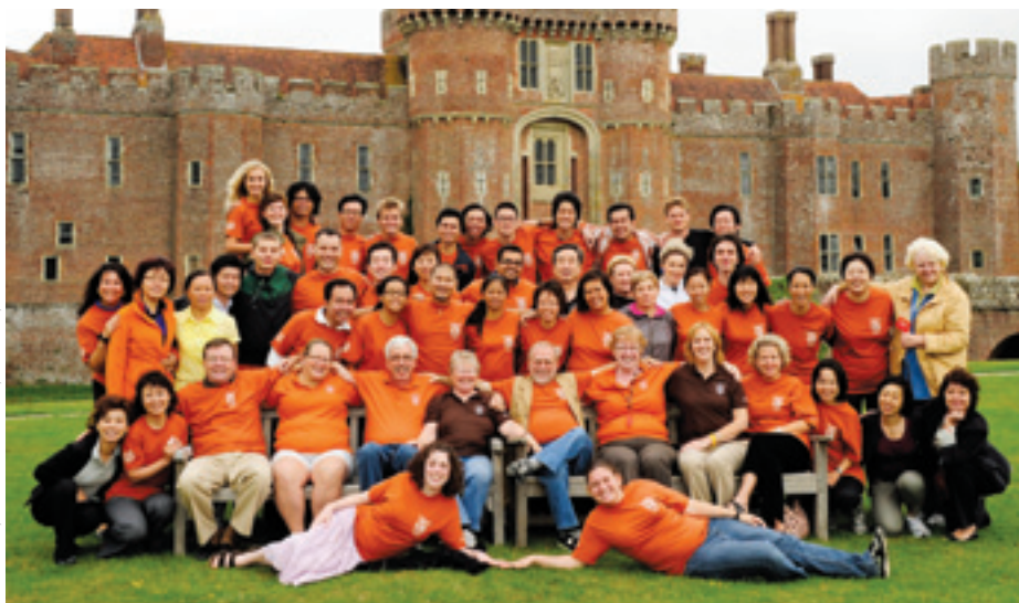
Summer School PEN-International’s 2010 Summer Leadership Institute in Sussex, England, brought together more than 50 students, interpreters and teachers from around the world.

All of these examples demonstrate NTID’s commitment to global education, research and partnerships. As noted in NTID’s Strategic Decisions 2020 , “Because the marketplace is increasingly global, students need an international focus as part of their education...they need access and support to study abroad...and international topics, issues and comparison infused throughout their curriculum.”