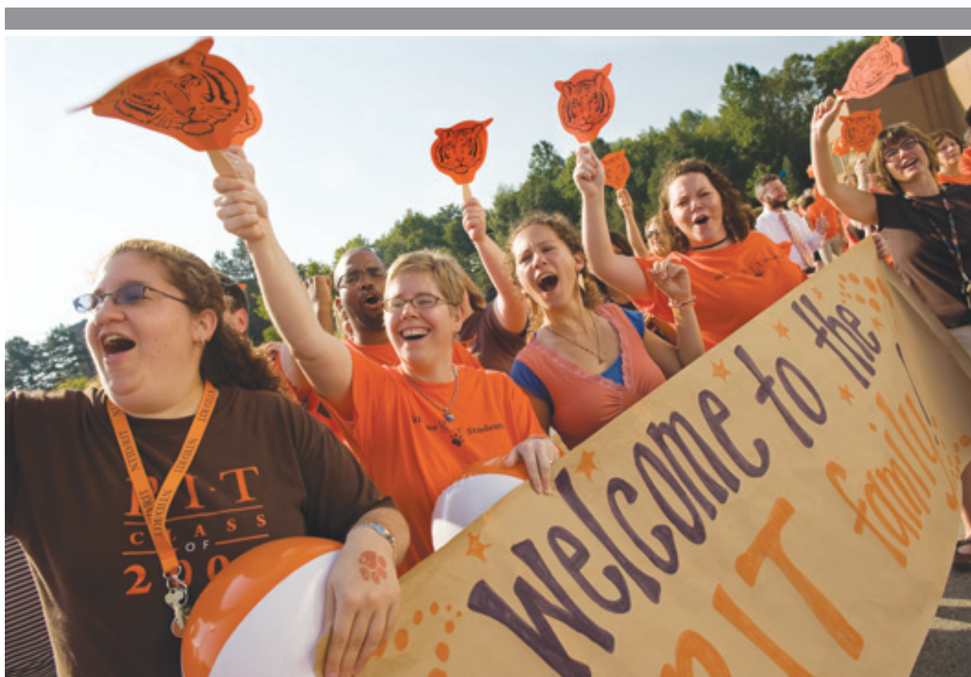
A Rousing Tiger Welcome NTID faculty and staff welcomed students during the annual Tiger Walk in September. For the third consecutive year, NTID has welcomed a record number of enrolled students.