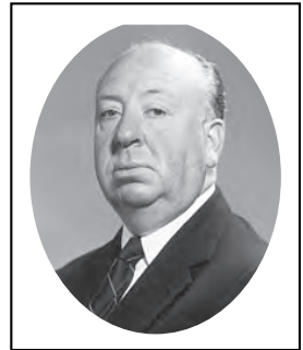
Sir Alfred Joseph Hitchcock circa 1960s

Sir Alfred Hitchcock (1899–1980), often hailed as the “Master of Suspense,” was one of the most celebrated directors in the history of cinema. Born in London, Hitchcock began his career in the British film industry as a title card designer during the silent era, quickly moving into screenwriting and directing. By the 1930s, he had established himself as a gifted storyteller with a unique ability to combine tension, humor, and psychological depth.