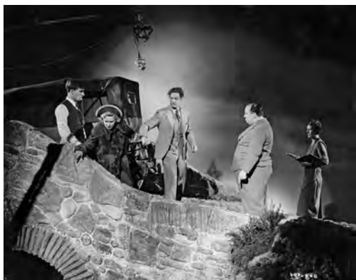
The 39 Steps (1935)

"Puns are the highest form of literature."