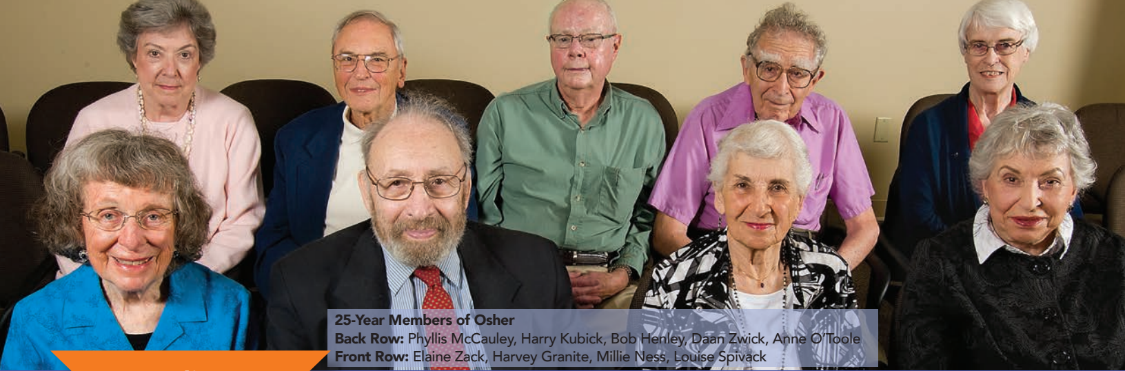
25-Year Members of Osher