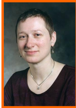
Julie White Women's Center