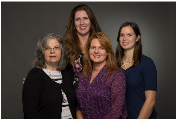
School of Mathematical Sciences Staff

This team's work demonstrated a collective – unshakable – commitment to the larger purpose of higher education - the public good. They focused efforts on increasing student voter registration, increasing understanding of absentee and in-person balloting, offering debate-watching parties and increasing voter turnout for the 2016 presidential election; all to raise awareness and inspire civic action.