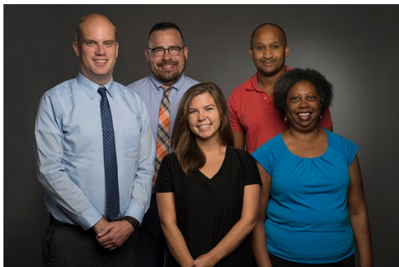
ROAR the Vote Implementation Team

These staff members are incredible resources to our students. They work hard to identify students in need and to link them to supports before a crisis/emergency happens. They consistently work to help craft creative out-of-the-box plans to reduce the impact of these needs on a student's academic performance. Without the tireless efforts of the Apartment Area staff, many hundreds of students would not get the support that they need to be successful here at RIT.