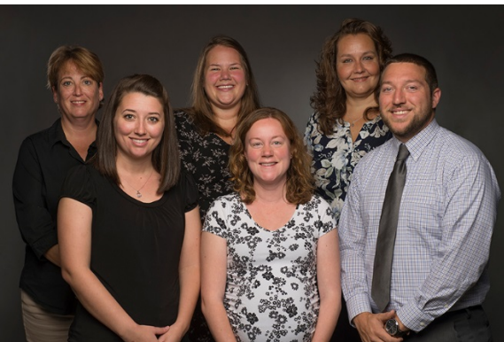
Residence Life Apartment Staff

On November 20, 2016 these officers demonstrated compassion and dedication unequalled in our community. They saved a student's life, successfully reestablishing the student's pulse just as emergency medical services were arriving. The student survived for several days following this event, allowing their family and loved ones to share their final days with them, a gift that may not have been possible if it were not for the quick and decisive actions of this team.