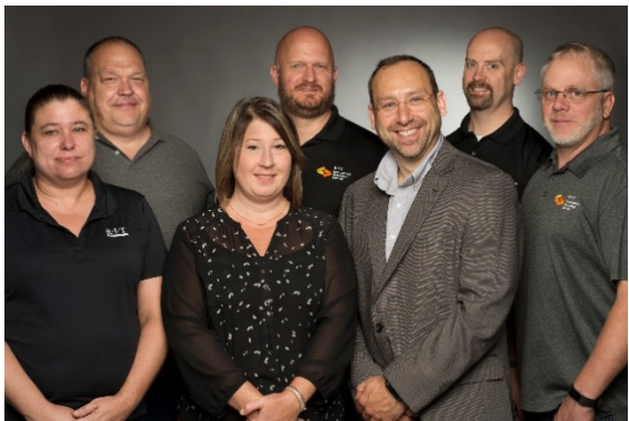
Network Sustainability Project Team