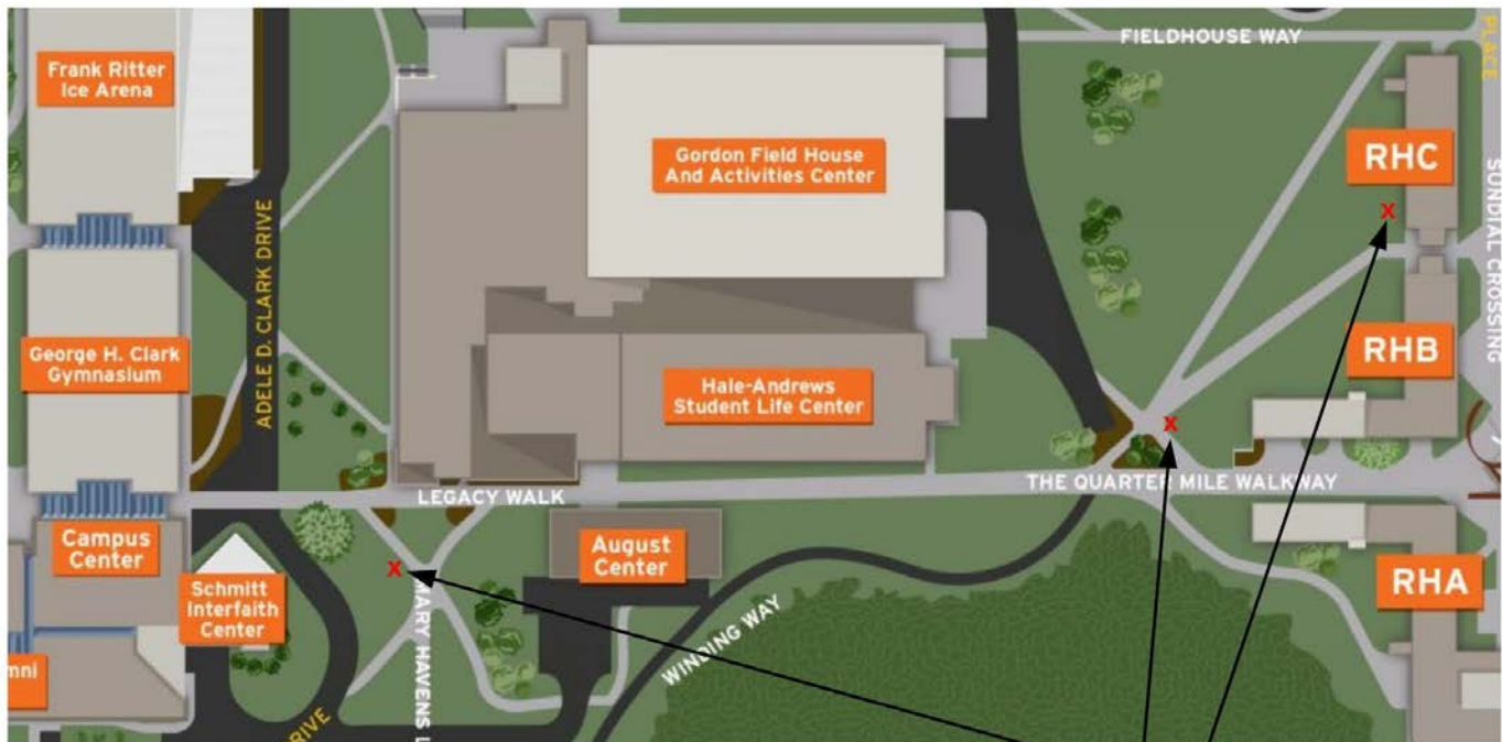
Locations of the paintable rocks

The location of the official paintable rocks are marked with red Xs below: