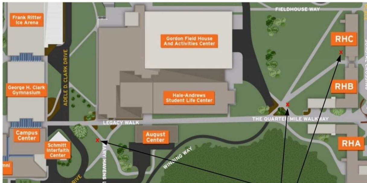
Locations of the paintable rocks

The location of the official paintable rocks are marked with red Xs below: